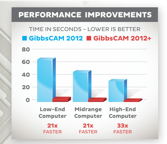
TREMENDOUS SPEED IMPROVEMENTS

The GibbsCAM 2012+ release includes tremendous speed and performance improvements, including a rendering option specifically geared for multi-axis parts, improved cutting strategies, and many productivity enhancements. This new version includes improvements for all levels of GibbsCAM, including the Mill and Lathe Production, SolidSurfacer, Radial Milling, Multi-Task Machining (MTM) and 5-Axis options, delivering ongoing value to existing Maintenance customers as well as new users.